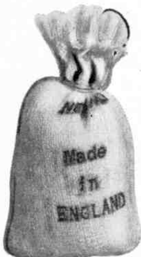
The Meccano Loaded Sack (Part No. 122).