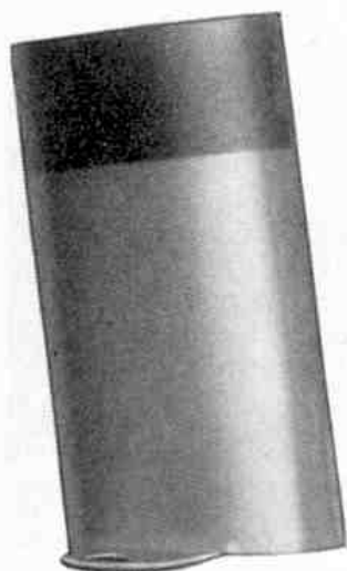
Another popular re-introduced part is the Ship's Funnel (Part No. 138).

that it is free to turn in fixed bearings and is slowly rotated through gearing from the driving shaft of the loom. The other Roller is placed above and in contact with the first one, and is free to move