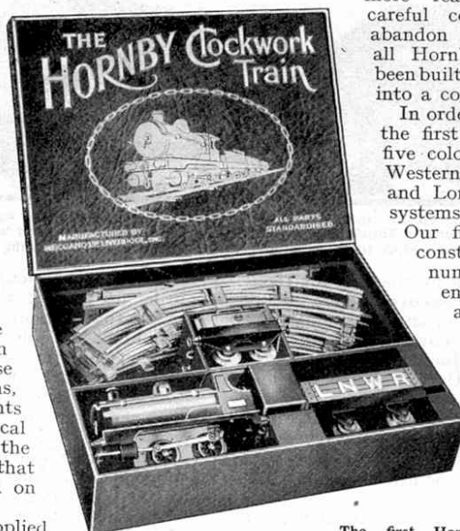
The first Hornby Train Set. The engine, tender and truck were built up from standard parts.