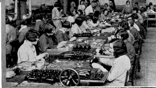
Hornby Trains in the making. (Top) Enamelling a locomotive by means of a compressed air spray. (Centre) Hand finishing locomotives. (Right) Testing locomotives for hauling power and length of run.