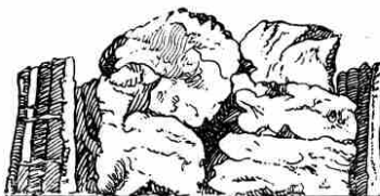
Fig. 1. Method of Constructing Early Breakwater*

Some people may be inclined to wonder at the statement that the sea can exert any destructive power upon our coasts, but we have only to notice how the waves lift