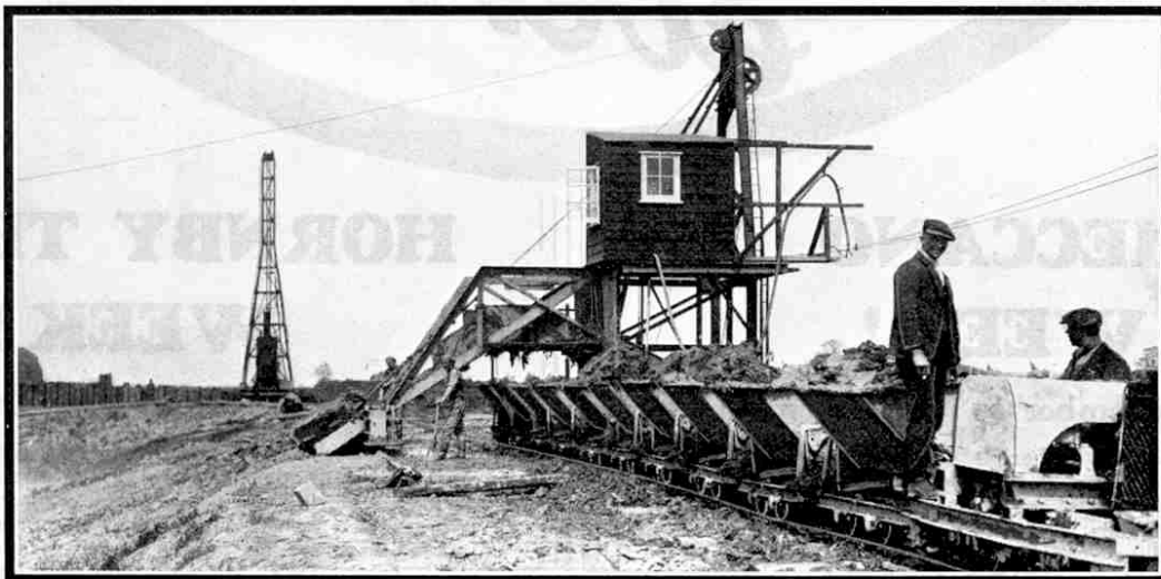
The head carriage of the Henderson Cable Drag-Scraper, with the bucket about to ascend the ramp. The tall structure in the background is a derrick.

We hope competitors will pay particular attention to these points as in many recent competitions it has been impossible to illustrate the prize-winning models owing to the unsuitability of the photographs.