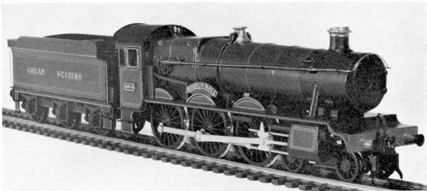
A fine model of the Wills 'Eshton Hall' fully painted and lined out.