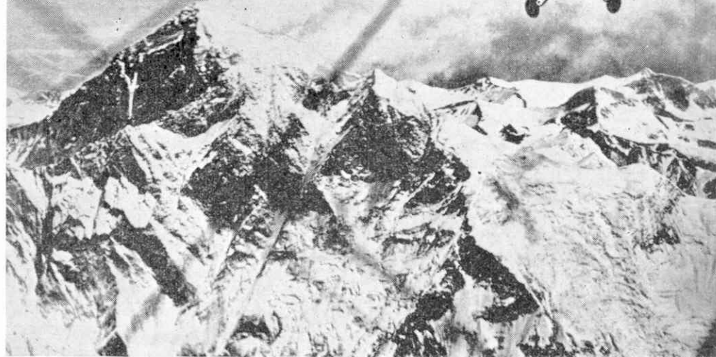
Over Everest! The Houston-Westland P.V.3