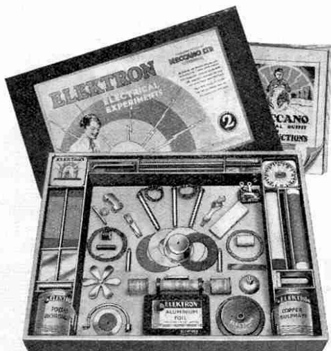
Elektron Outfit No. 2 Price 25/-

Manufactured by MECCANO LTD. BINNS ROAD LIVERPOOL 13