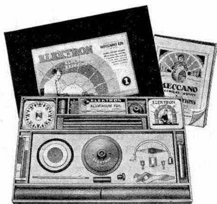
Elektron Outfit No. 1 Price 8/6