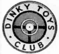
The Dinky Toys Club Badge is beautifully enamelled in colour

ht and enthusiasm which they arouse, it is not surprising that there do for their owners what the Meccano Guild and the Hornby Railway el-building and in the construction and running of miniature railways. new organisation to accomplish this has therefore been created by Mr.