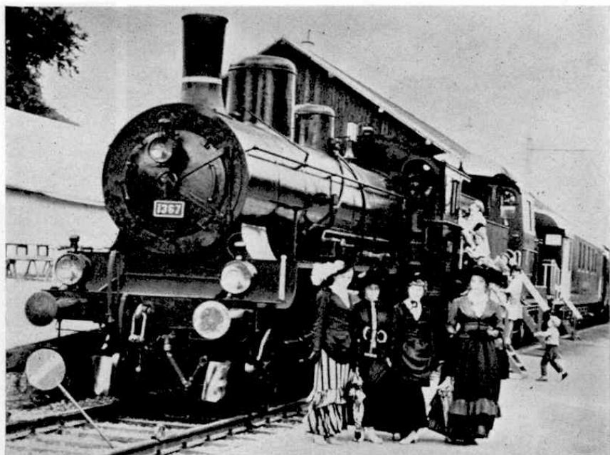
Travel a hundred years ago—this Swiss Federal Railways train of the 1860's is still operational and will be used for the re-enactment this summer of the first conducted tour of Switzerland.

Europe's first mountain railway which climbs to the top of the Rigi. Opened in 1871 it is another historic line which will have a part in this month's celebrations.