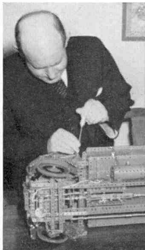
Fig. 4. Another view of the Albion Chieftain showing the details of the chassis.

this came to my notice recently when I received details of a fine model of an Albion Chieftain lorry built by the Rev. G. H. Retief, of Elsburg, Transvaal, South Africa. The model, together with its builder, is shown in accompanying illustrations, and is complete with steering gear, four-speed gear-box, clutch and differential. It will be noticed that the model is remarkably neat and clean in outline, and it has a solidarity of appearance that is sometimes lacking in models of this type based on modern heavy goods vehicles.