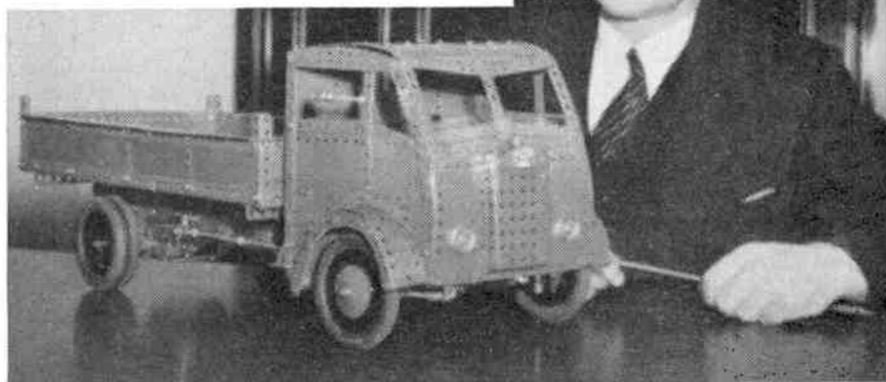
Fig. 3. The Rev. G. H. Retief, Elsburg, Transvaal, photographed with his model of an Albion Chieftain Lorry.

the Rubber Ring on the 1" Pulley by a Compression Spring fitted between the boss of the Flanged Wheel and the Obtuse Angle Brackets. A Bolt is fixed in each of the holes in the Flanged Wheel, and these engage Bolts in a Collar fixed tightly on shaft 4 between the Flanged Wheel and the 1" Pulley. The action of these Bolts ensures that the Flanged Wheel rotates with shaft 4, but it can be slid to the rear against the pressure of the Compression Spring.