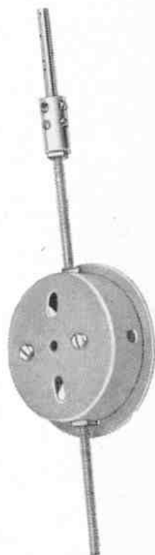
Fig. 2. The clock pendulum and weight "bob."